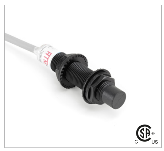
Note: The product images shown may change over time as products are updated.