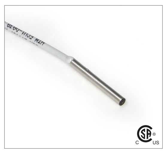
Note: The product images shown may change over time as products are updated.