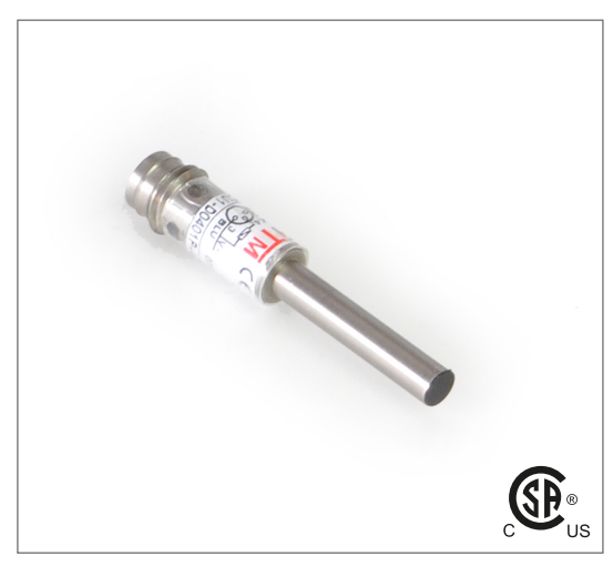
Note: The product images shown may change over time as products are updated.